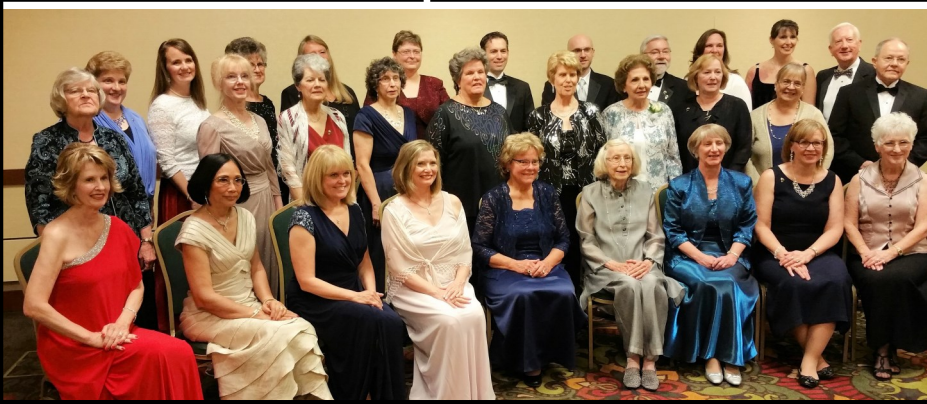
Group Picture of State Presidents.