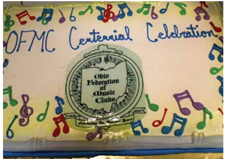
OFMC Centennial Celebration cake.