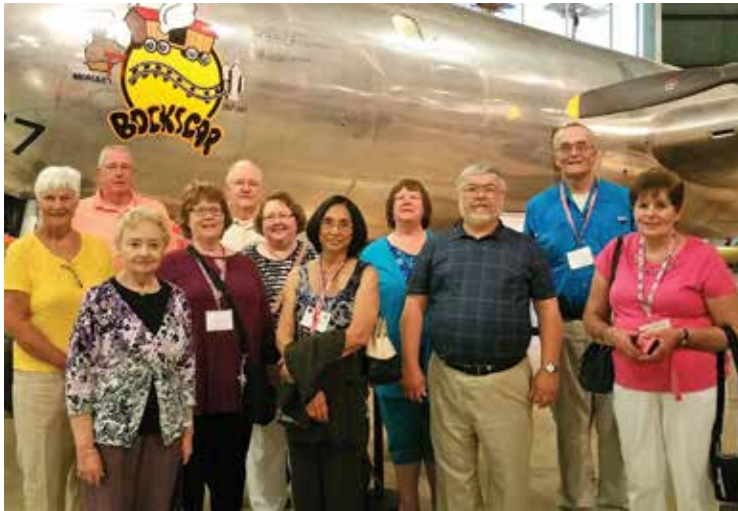
Tour of the National Museum of the US Air Force.