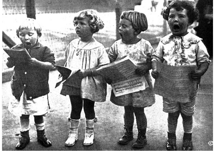
You are never too young to participate in National Music Week!