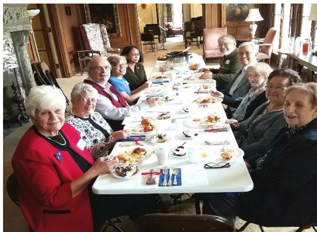
District 4 conference attendees